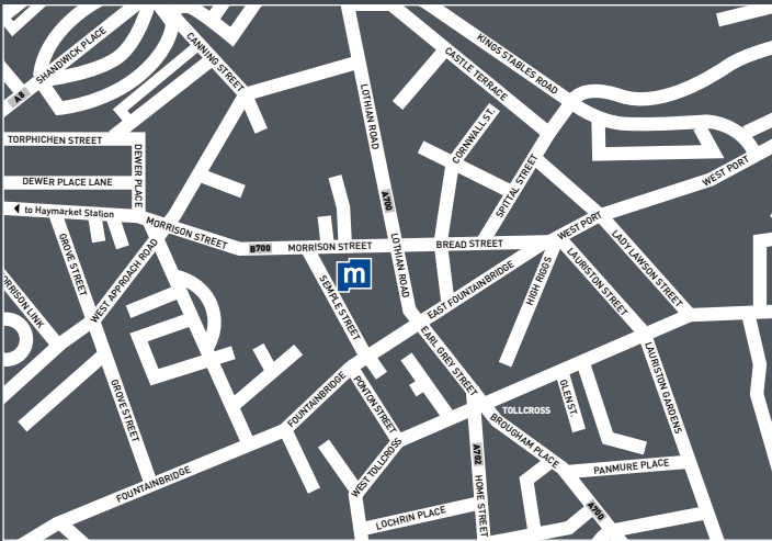
EDINBURGH OFFICE EXCEL HOUSE 30 SEMPLE STREET EDINBURGH EH3 8BL T: +44 (0)131 229 5046 F: +44 (0)131 229 0849

We are a full-service commercial law firm, with specialists covering every area of legal advice to which businesses and public sector bodies need access, as well as providing the full range of wealth management services (including tax, wills, trusts and executries) to our private clients.